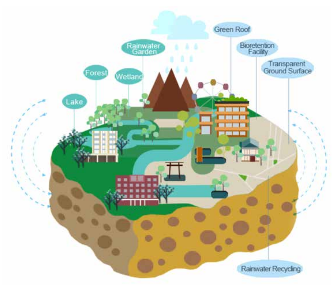
Figure 1. Illustration of the Sponge city concept (updated from Chinese version by authors)

Construction (Figure 1) at the end of 2014 all over China.