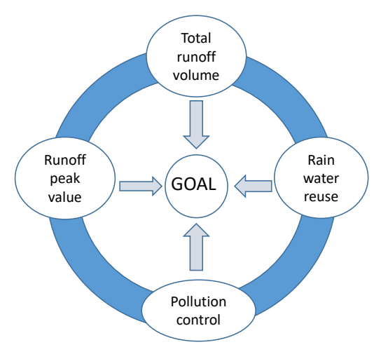
Figure 2. Goals of Sponge city construction plan

The Sponge City Construction (SCC) announced a new paradigm that calls for the use of natural systems, such as soil and vegetation will